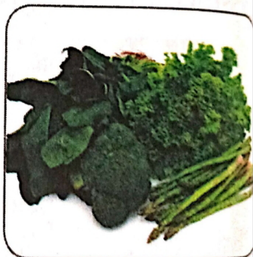
green leafy vegetables